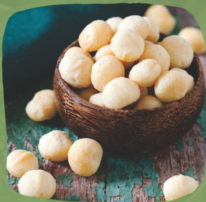
Roasted Macadamia Nuts & Vacuum Cooked Crispy & Dehydrated Pineapples