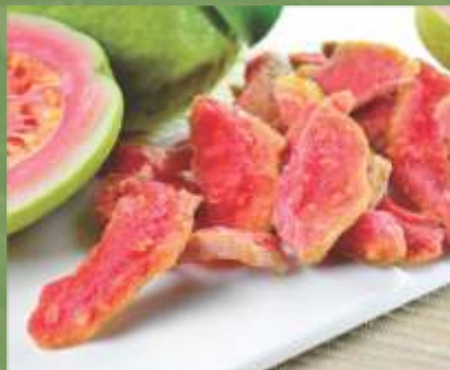
Dehydrated Soft Dry Guava