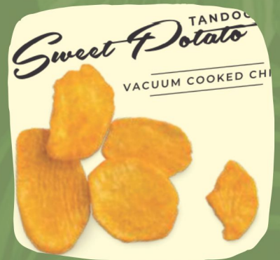
Roasted/Vacuum Cooked Sweet Potato