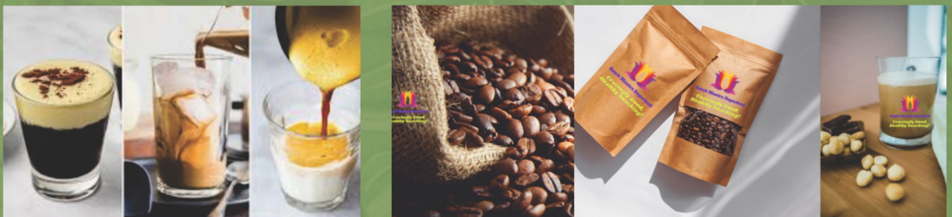
Coffee: Macadamia & Coconut