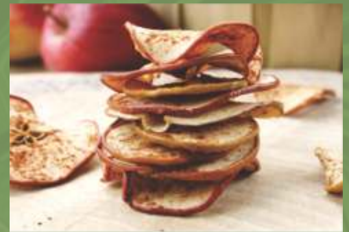
Dehydrated Fuji Apple