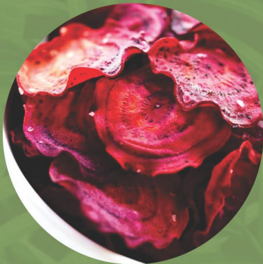
Roasted/Vacuum Cooked Beet Roots

Amrit Mantra Superfood™ Cravingly Good, Healthy Snacking!